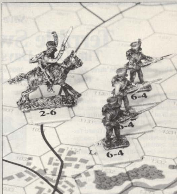
Photo above shows how the standard cardboard counters can be used as bases for the metal figures (by epoxying them together). Photo below shows part of the Wagram game map with the miniatures set up in their starting positions.

Now you can combine the visual beauty and authenticity of military miniatures with the convenience and realism of grid-map boardgaming. SPI is happy to present complete orders of battle in miniature with two of its finest Napoleonic boardgames — The Battle of Wagram and The Battle of Nations (Leipzig). Each set contains almost 100 highly detailed, 15mm cast metal figures by Heritage Models, Inc. plus the complete game with its cardboard counter equivalents.